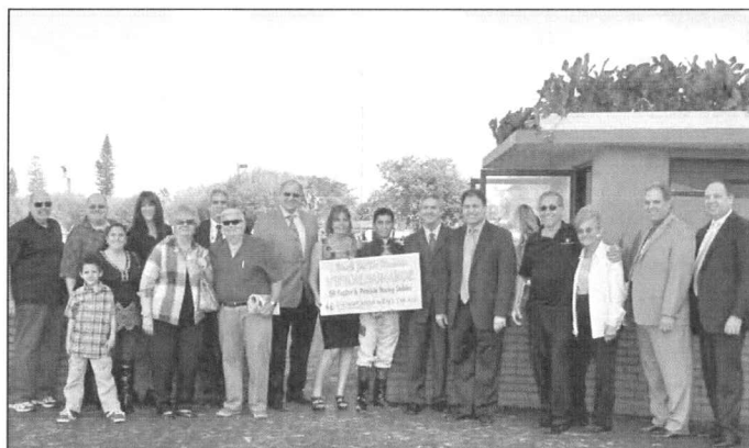
Pinnacle Racing Stable in the winner's circle