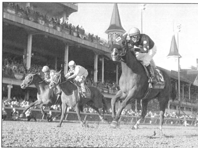
Musical Romance winning 2011 Breeders Cup Filly and Mare Sprint

To learn more, anyone interested in Pinnacle may go to the website www.pinnaclestable.com and contact Lazarus and Kaplan.